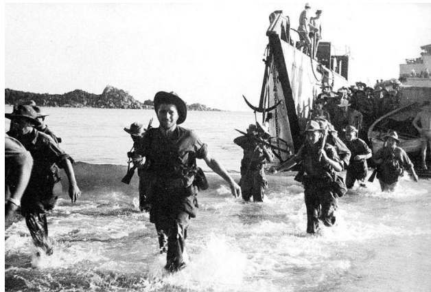
Figure 1 Indochina Wars I, II, and III Page all - Kompas.com

From 1975 to 1979, there were 52,000 Indochinese refugees who entered Indonesia. According to a United Nations report (1979) there were 43,000 "Boat People" in Indonesia's Riau Islands on 30 June 1979, most of whom were Vietnamese and a small number were Cambodians and Laotians. Even though in 1975 and March 1979 there were 200,000 Indochinese refugee settlements in countries receiving asylum, it was Southeast Asian countries that had to take care of more than 340,000 people trapped in camps such as in Malaysia and Thailand.