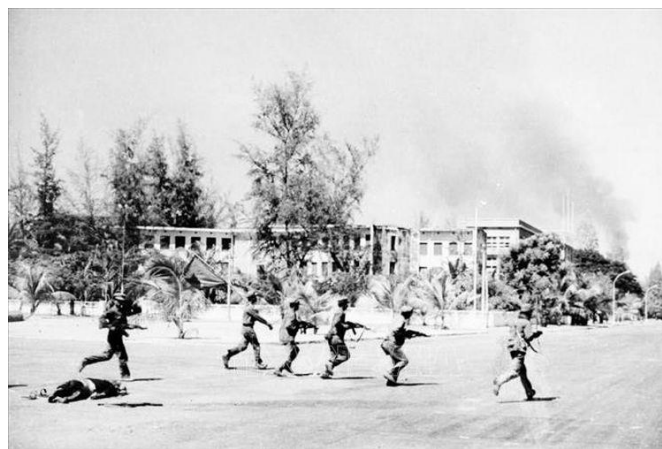
Figures 2 Indonesia's role in the III Indochina War Page all - Kompas.com

Cooperation between Indonesia and countries in Indochina, which include Vietnam, Laos, Cambodia and Myanmar, covers various fields such as economic, political, social, cultural and defense. The following are some significant forms of collaboration.