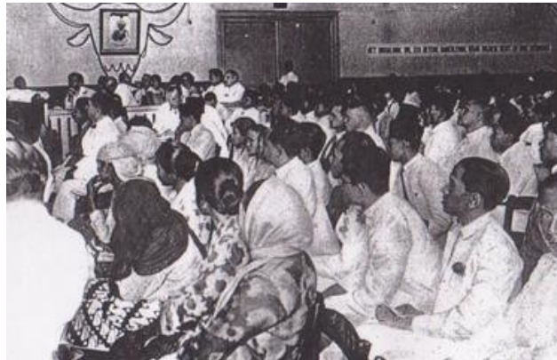
Figure 1 Political Situation during the Liberal Democracy Era

Policy is a series of decisions taken by individuals or political groups in an effort to determine goals and strategies to achieve these goals (Budiharjo, 1992:12). This policy is the result of wise and considered thinking, and is an effort to allocate resources and values for society or group members as a whole (Abidin, 2004:20).