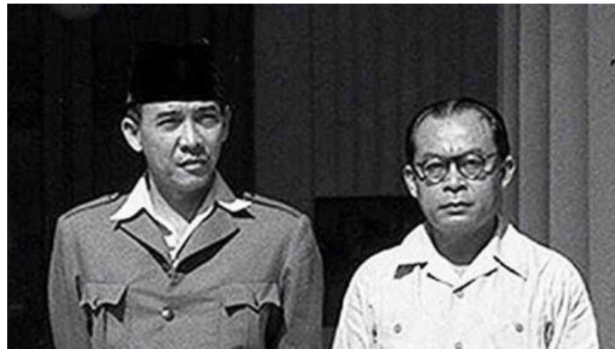
Figure 2 Soekarno-Hatta Feud

On August 17, 1945, they jointly proclaimed Indonesian Independence. During the independence revolution, the Soekarno-Hatta Dwitunggal grew into a myth that was synonymous with the struggle for independence and Indonesian unity. However, this myth seemed to disappear after the PKI entered the political arena of government.